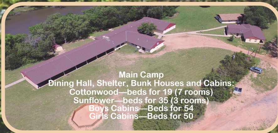
Main Camp Dining Hall, Shelter, Bunk Houses and Cabins: Cottonwood—beds for 19 (7 rooms) Sunflower—beds for 35 (3 rooms) Boys Cabins—Beds for 54 Girls Cabins—Beds for 50