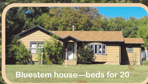
Bluestem house—beds for 20